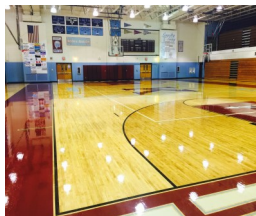
Contact the schools to check on rental fees.

School-affiliated, school-sponsored and school-related organizations may use our facilities free of charge under certain conditions. All other non-school related organizations may rent our facilities for a nominal fee.