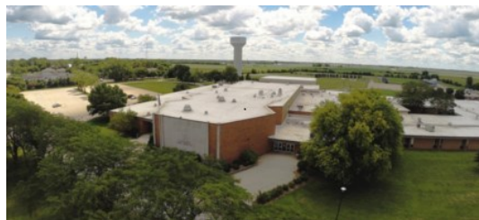
Organizations must provide $1,000,000 insurance coverage.